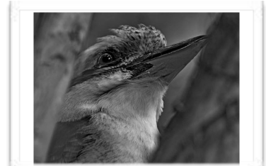
Tony Endersby - result 10 “ssh I’m trying to be quiet”