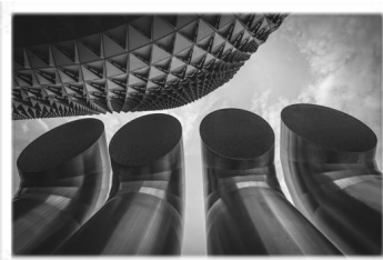
Jonathon Westra - result 10 “4 Pipes”

Here is a selection of the recipients who achieved a score of 8 or higher in the Digital categories.