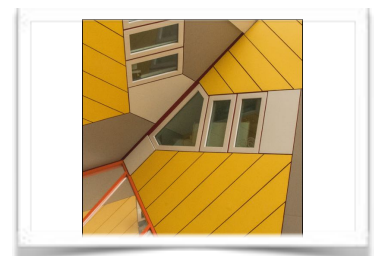
Henk de Weerd - result 8 “Windows to the World”