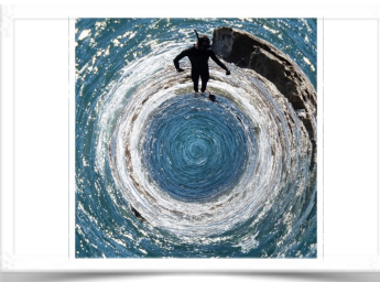
Paula Furlani - result 9 “Water Hole”